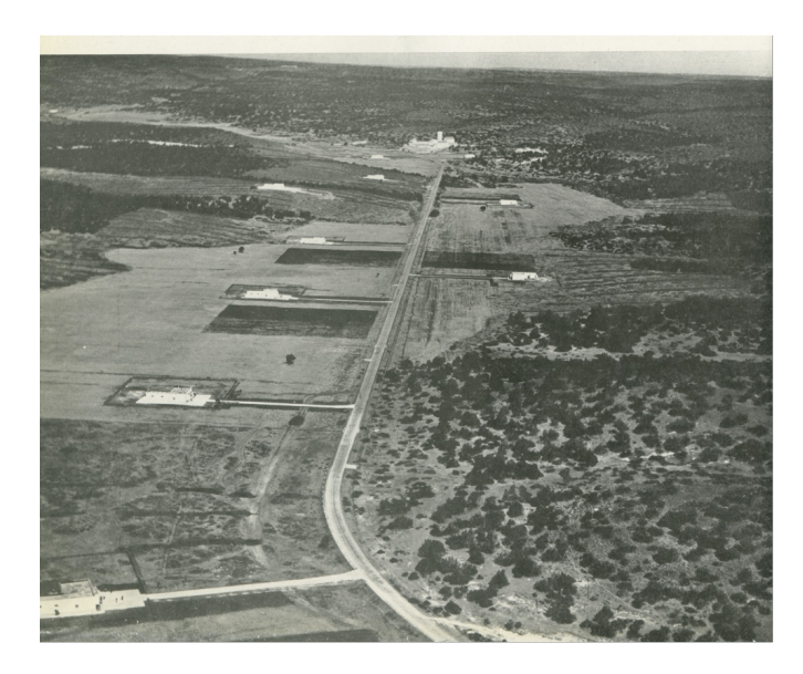
Figure 2: Motorway "Litoranea libica" and D'Annunzio village (I Ventimila. Documentario fotografico della prima migrazione di massa di coloni in Libia per il piano di colonizzazione demografica intensiva Anno XVII-1938, Tripoli 1939).

As with the concentration camps, also here it is the aerial images that provide the most extended and dominant view of the Italian intervention on the territory. From above, the agricultural centers and farmsteads seem to indicate an orderly and coordinated use of an otherwise "virgin" territory: to the colonizer's eye the land was empty, uncultivated, and unused. The centers looked modern, well-ordered, efficient, and their white-washed walls sparkled in the North African sun. Yet once again the aerial image is an illusion. The pictures of the gleaming new settlement villages belied a fertile land that nonetheless was not suited for intensive cultivation. Tied to a fallacious interpretation of ancient Roman history, which envisioned Libya as the empire's breadbasket, regime propaganda portrayed dormant fields in need of laborious Italian migrants (Munzi 2001). But this mega project, like so many others of its kind, was built on misconceptions about the environment and the ways in which humans could thrive long-term in particular climates and terrains.