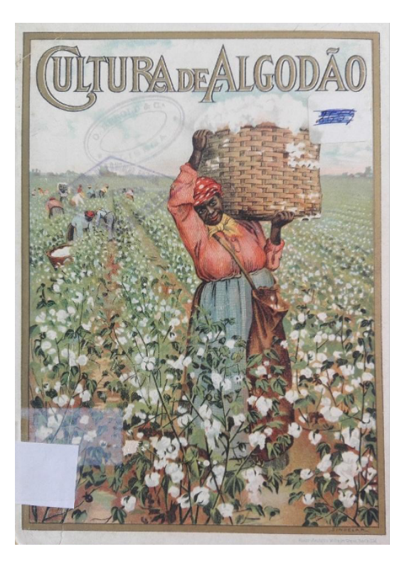
Figure 5: Cover page of the brochure Cotton Culture (in Portuguese) published by the Potassium Salt Mines of Stassfurt (Germany), 1906.

eradicate them. Once the oxycarenes had infested a field, they were impossible to eradicate. Therefore, the only solution was to abandon the land and start making successive harvests to reduce the exposure time of the open capsules (Barbosa 1951, 129).