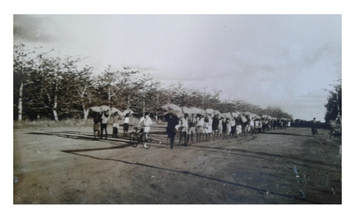
Figure 7: Carrying cotton to sell to the concessionary at the market, Cabo Delgado, 1968. In front, the white man exhibits his bicycle - a highly sought-after item.

the markets. Technical guidance, which was the exclusive responsibility of the Board, would follow the guidelines established by the Nature Protection Council regarding the conservation of soil and flora. The most novel feature of this system was the possibility of creating cooperatives of indigenous people who could directly sell products to concessionaires. Cooperatives came to be seen as 'a vehicle for civilization and a useful method of collaboration'.