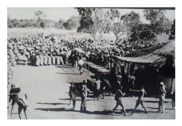
Figure 8: One cotton 'market' in Cabo Delgado, 1968.

Cotton cultivation was required to follow the 'plans' for each campaign, which were proposed by the concessionaires and approved by the district governor after hearing the technical body. Mandatory programs were introduced to modify indigenous farming methods and to promote their