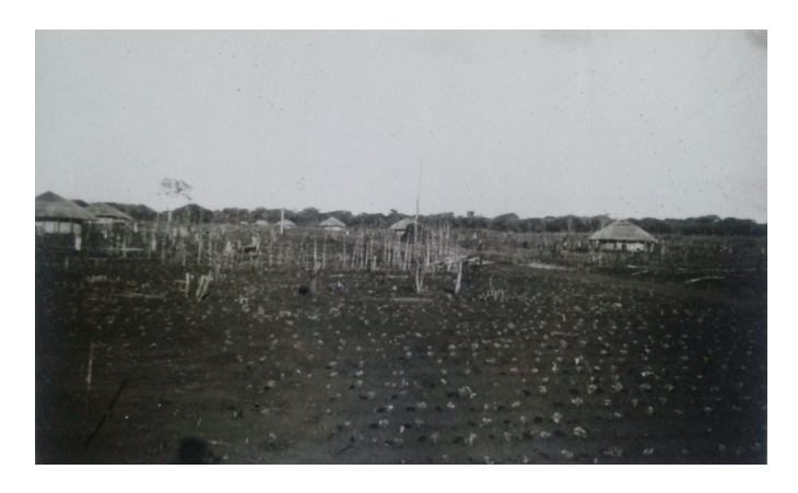
Figure 4: Cotton concentration camp with cotton (first week), Sagal, Cabo Delgado (Santos 1968).

The increase in the number of concentration camps depended to a large extent on the interest and commitment of the concessionary companies and local administrators to mobilize peasants who had been harassed by years of droughts, floods, and plagues, as well as physical punishment and rape by the foremen, agents, and sepoys. The concessionaires had no interest in this scheme because they realized that crop rotation would diminish cotton production, and that indigenous people were not willing to leave their homeland. The burden of environmental risks fell entirely on the farmers, who often petitioned for better pay in order to compensate for these risks. However, local traders often underestimated the quality of cotton in order to avoid paying higher prices. In 1951, in the Mogovolas district, for example, between three and four thousand people died of starvation because of plagues that destroyed cotton crops - a phenomenon that was only noticed when victims of starvation started showing up at the hospital in Nampula (Pitcher 1995, 132). For all these reasons, the percentage of people in cotton concentration camps in Mozambique remained below initial expectations.