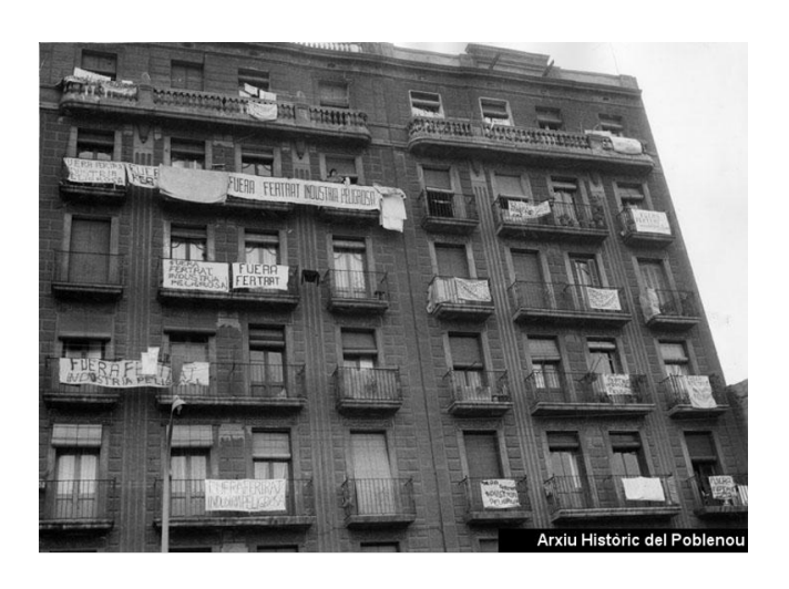
Figure 3: Protest against Fertrat chemical industry (Poble Nou, Barcelone 1975).

for pines every week, on every three-day weekend". 21 In Barcelona, in the districts of Poble Nou, Nou Barris, Horta, and El Carmelo, neighborhood communities fought in vain against chemical industries and speculation projects (Figure 3).<sup>22</sup> In the Valencian working landscape, there was a struggle over access to nature and outdoor recreation around El Saler and La Albufera (Hamilton, 2018). The working-class districts of Murcia and Seville, Carmona, Jaen, Granada, and Huelva also reclaimed green spaces and fought for the monitoring of industrial and air pollution and better environmental conditions (Escudero Andújar 2007; Pérez Cebada 2015; Contreras Becerra 2018). In peripheral communities from north to south, a link emerged between environmental security inside and outside the factories that were placed close to workers' housing. In 1972, the Manifest for Aragón's Communist Party asserted: "In Spain, Aragón definitely has what we could call, without any kind of exaggeration, an internal colonization situation, which will lead inexorably to the economic, social and political degradation and the fall of our region". 23