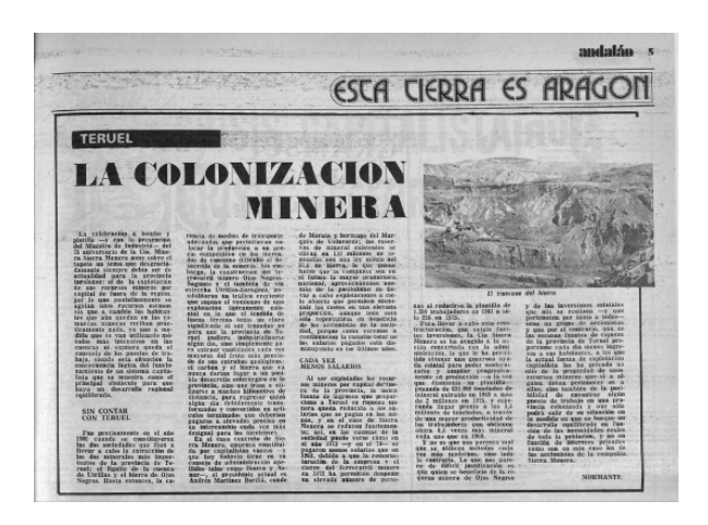
Figure 1: "Mining colonization" described by Biescas Ferrer.