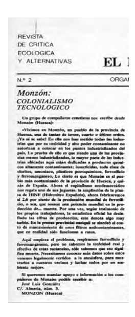
Figure 2: "Technological colonialism" in Monzón.

shares of the Hidro-Nitro company in Monzón (Huesca). According to Biescas Ferrer, the heavy chemical industry was installed there "due to the difficulties encountered by the multinationals in the existing anti-pollution legislation on the other side of the Pyrenees". Silicomanganese and refined ferromanganese were products that emitted "strong pollution during their manufacture and which are mostly exported (Biescas Ferrer 1977, 193). Etino Química became a subsidiary of Monsanto Ibérica, a company which was set up in Monzón. Cementos del Cinca was founded in 1956 to produce cement and concrete. Monzón was known for being one of the most polluted cities in Spain. Since 1973, the provincial sanitation board tried unsuccessfully to close these industries because of their industrial pollution (Corral Broto 2011).